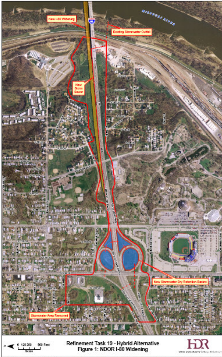
Figure 1 – HY-115-1 NDOR I-80 Widening