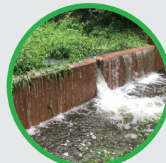
Elmwood Park Weirs

Natural and engineered systems mimic nature to manage urban stormwater and improve water quality to rivers and streams.